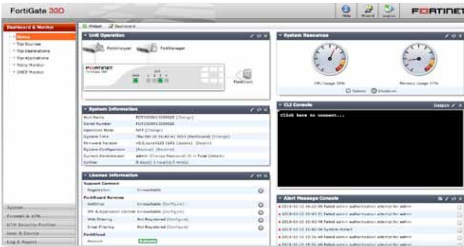
GUI Lite Dashboard — Single Pane of Glass Management

For complete, up-to-date and detailed feature set, please refer to the Administration Handbook and FortiOS Datasheet